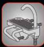
Conduit to tray adaptor