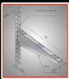
NOVO U-Channel bracket