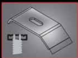
Hold down clamp