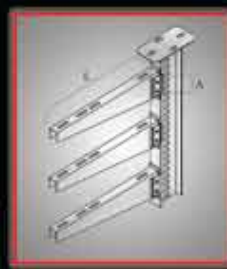
I Beam bracket